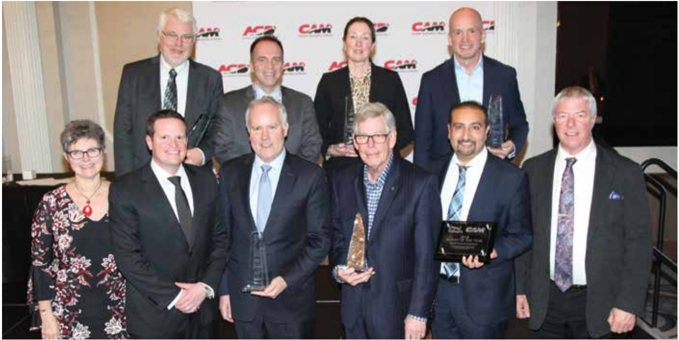
The Class of 2018