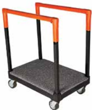
Panel Carts $3.50/day