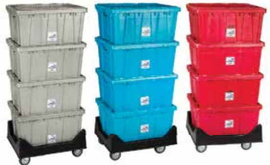
Plastic Moving Bins .75¢/week