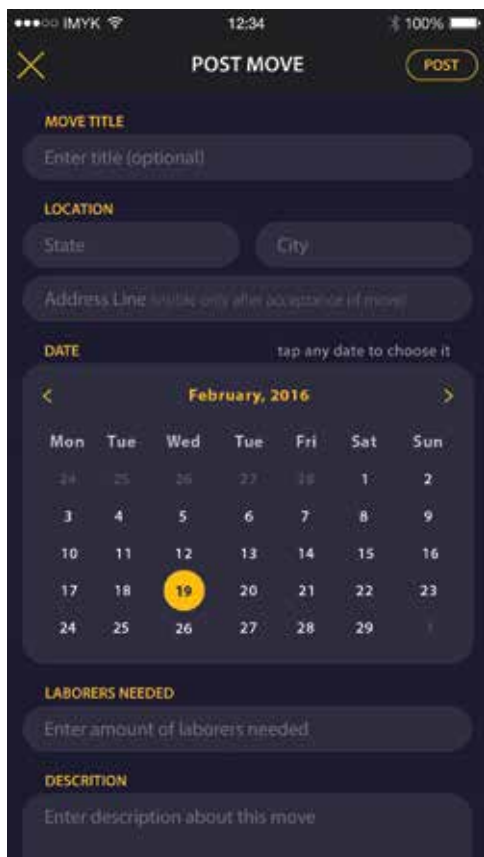
A screenshot of the LaborNet app.

“At this point we have the platform in place and now we’re just looking for the interest and the traction from the industry,” says Hopkins.