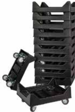
Bin Dollies $2.00/week