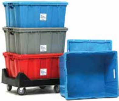
Plastic Moving Bins .75¢/week