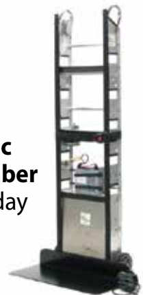
Electric Stairclimber $75.00/day

1745 Meyerside Drive, Units 9&10, Mississauga, ON L5T 1C6 4500 Sheppard Avenue E., Unit 41, Scarborough, ON M1S 3G6 Phone: 905.670.2778 • Email: orders@themoverschoice.com www.themoverschoice.com