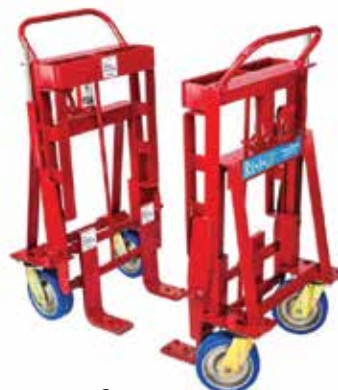
Safe Mover $75.00/day