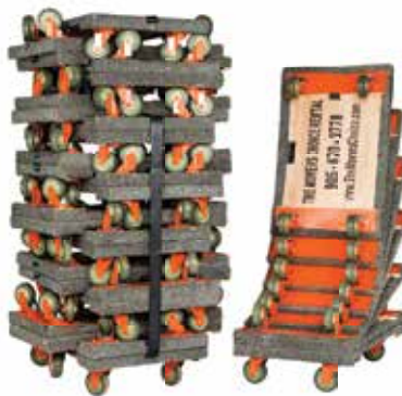
Flat Dollies .75¢/day