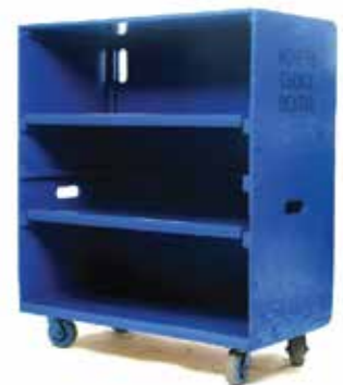
Terminal Carts $3.50/day