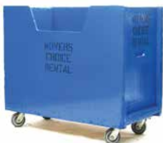
Open Bins $3.50/day