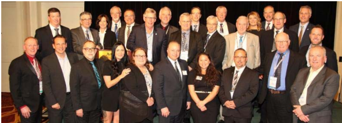
2016 CAM Executive, Directors and Award Recipients

Our annual conference in Toronto was another great success, based on the feedback we've received so far. We had about 100 attendees at the sessions, 21 trade show booths and 150 attendees at our annual awards dinner - our most ever! Thanks to our sponsors and exhibitors for supporting the event and to all the attendees who helped